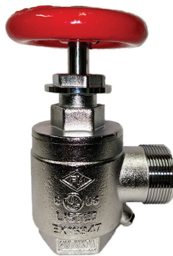
15M Satin Chrome Finish