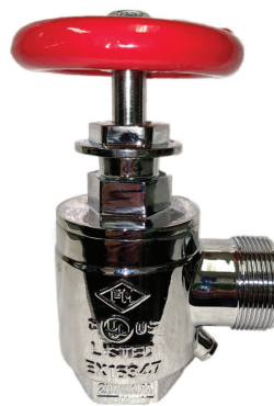
15M Polished Chrome Finish