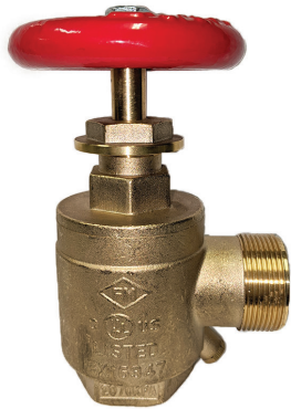
15M Standard Brass