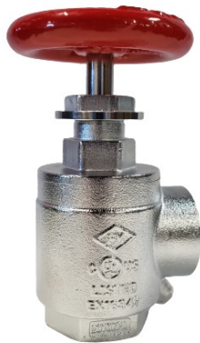
15F Satin Chrome Finish