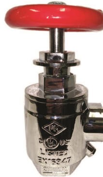
15F Polished Chrome Finish