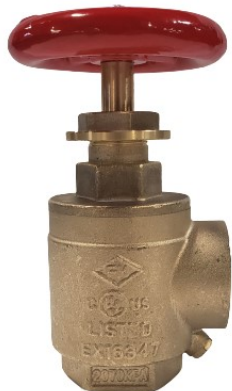
15F Standard Brass