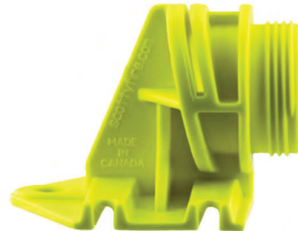
4056-15 – Male NPSH 15 GPM