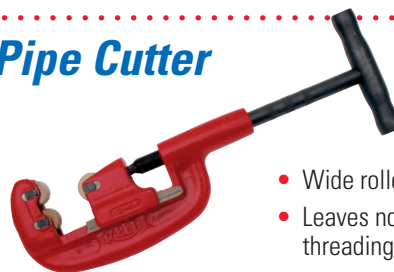
2-1 Pipe Cutter