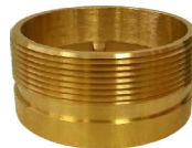
For grooved 4" connection; use NFE model A88GB adapter