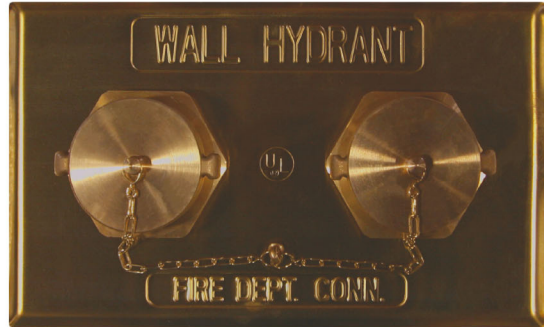
Model 230 Wall Hydrant Connection

Flush design; for when appearance counts. Double outlet hydrant connection or pump test connection.