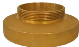
For 6" threaded connection; use NFE model A104 adapter