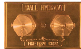
230 NRS Gate Valve