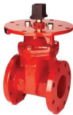
NRS Gate Valve