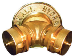
294 Hydrante Connection