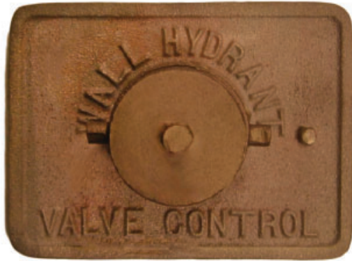
Model 231 (Square Plate)