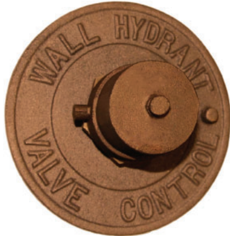
Model 264 (Round Plate)

National Fire's model 231 and 264 are valve control assemblies designed for non-rising stem gate valves. They allow for operation of the gate valve from outside of a wall when the valve is located behind the wall. All fittings and adapters are made from cast brass and are also available in a chrome finish. This assembly works in connection with our model NRS gate valve, as well as our wall hydrant connections; model 294 (surface wye style) or model 230 (recessed style). Please see the diagram on the following page to see how these components work together to create a complete wall hydrant.