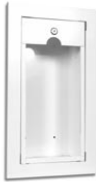
Classic Cabinet with recessing frame