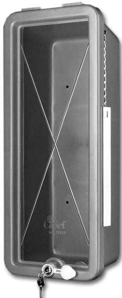
The Chief Cabinet