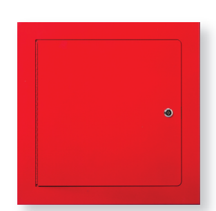
Valve / Hose Cabinet