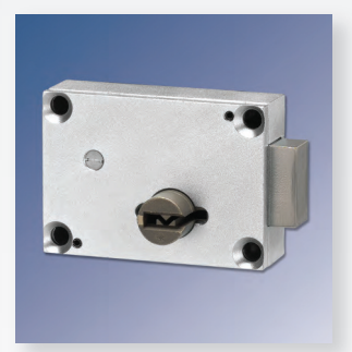
Model 7010 & 7017 Max Security Deadbolt Lock