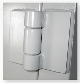
Model H2301D Maximum Security Hinge