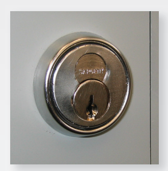
Mortise Deadbolt with Cylinder