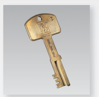
Maximum Security Door Lock Key