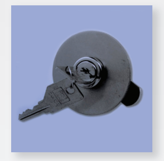
Model 151 Cylinder Lock