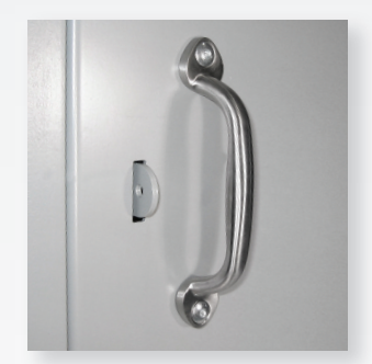
Pad Lock Door Hasp