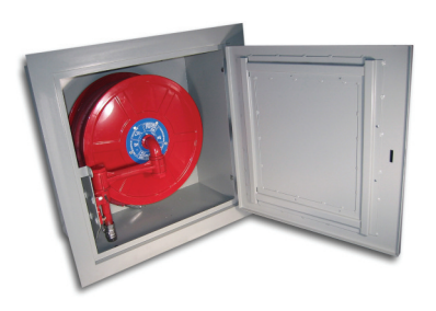
Reel Cabinet (with reinforced door)