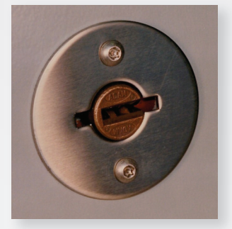
Escutcheon for Maximum Security Lock