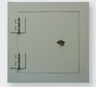
Maximum Security Access Door