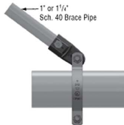
Longitudinal Brace Orientation (Brace Pipe Parallel to Service Pipe Axis)