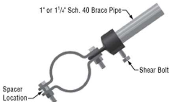
Lateral Brace Orientation (Brace Pipe Perpendicular to Service Pipe Axis)