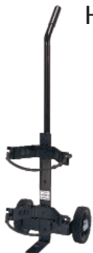
Heavy Duty Dolly Cart