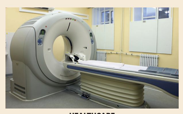
HEALTHCARE Aluminum Valve Dry Chemical, CO2, Clean Agent, K Class, Water Mist, Wheeled