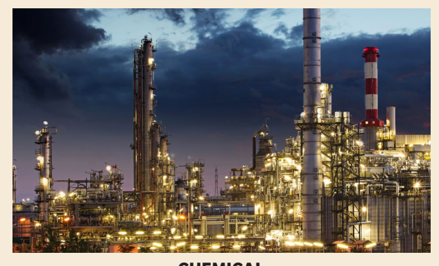
CHEMICAL Brass Valve Dry Chemical, Z-Series, Wheeled