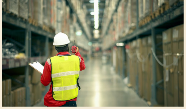
DISTRIBUTION CENTERS Brass Valve Dry Chemical, Z-Series, Wheeled