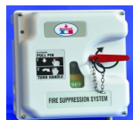
UCH Control System P/N 60-120099-002