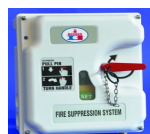
UCH Control System P/N 60-120099-002