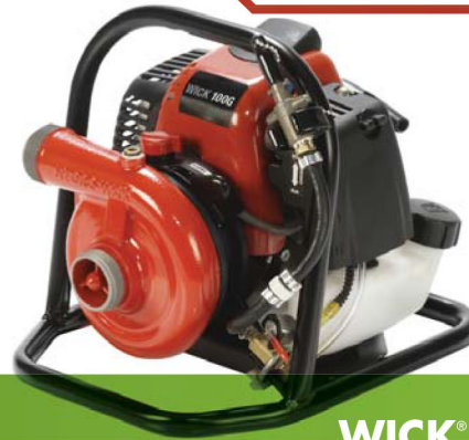
WICK® 100G (RFT MODEL)