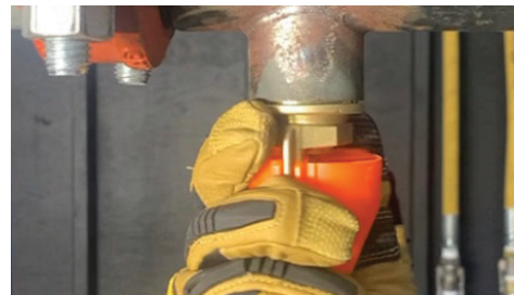
Tool-Free Hand Tightening

This sprinkler includes a welded outlet fitting enabling you to install sprinklers faster than ever – leaving tools, tape and overtorquing behind.