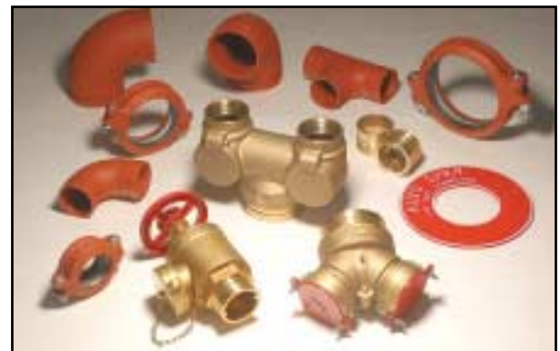
Above, grooved end connections

National Fire Equipment Ltd. is a leading supplier of standpipe fire fighting equipment including fire hose cabinets, valves, fire hose, extinguishers, fire department connections, and pressure regulating valves. All standpipe products offered by NFE conform to NFPA-14 standards or local building code requirements. For a complete listing of National Fire's standpipe products, visit our website www.nationalfire.com or contact customer service center at (800) 267-8508.