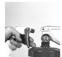
20. Thoroughly check all areas on the unit that may leak pressure. a) welds b) gauge face & threads c) valve body o-ring d) valve stem seat