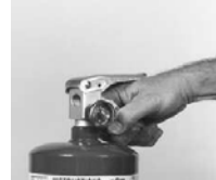
17. Rotate the valve in a clockwise direction until a "click" is heard. This engages threads and minimizes stripping. Hand tighten valve with clockwise rotation.