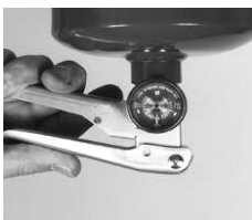
2. Invert extinguisher and discharge all remaining expellent gas.