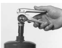
16. Return cleaned valve and syphon tube to the correct cylinder. NOTE: After filling cylinder, replace valve and syphon tube immediately while powder is still in an aerated state.