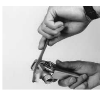
7. With a small brush, thoroughly clean the interior and exterior of the valve body threads, paying particular attention to the seat area. Pay particular attention to the pressure relief groove cut into the threads of the valve body.