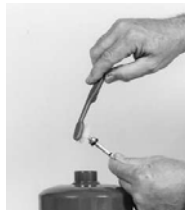
11. Clean the valve seat itself containing the sealing rubber. Strike First recommends replacing the valve stem assembly at every major service interval.