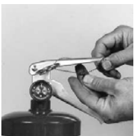
21. Place a pull pin through the valve body and discharge handle. Attach a sealing device.