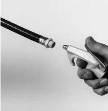
22. Check nozzle and/or hose for blockage and return to unit.