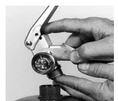
5. Using your finger or a suitable tool, press down on the valve stem located under the discharge handle.