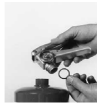
8. Carefully inspect the new Valve Body O-ring and install. Be careful not to damage o-ring on valve body threads.