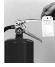
23. Authorize service tag & date.