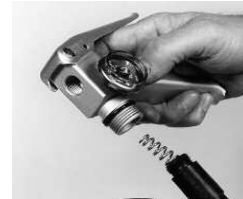
4. Detach syphon tube from valve with counterclockwise rotation. Remove spring.