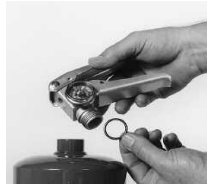
6. Remove body o-ring.