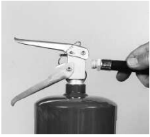
1. Remove the hose assembly or nozzle.

Before attempting to recharge be sure the extinguisher is completely empty and depressurized. Failure to comply could result in personal injury, death or property damage due to the violent movement of the loosened components.