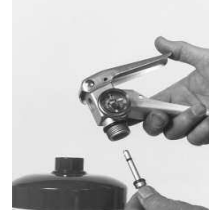
13. Re-insert valve stem assembly into the valve body. Push into place with your finger.