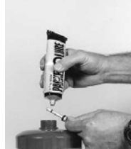
12. Place a small amount of lubricant along the circumference of the small o-ring only.