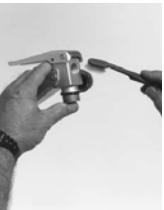
10. Clean outlet orifice with a small brush.