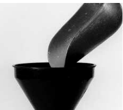
15. Fill the unit with the correct amount and type of dry chemical as stated on the fire extinguisher nameplate. Clean the cylinder threads thoroughly.