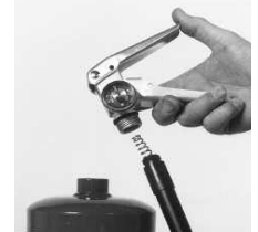
14. Return spring to syphon tube, turn syphon tube clockwise into valve body.