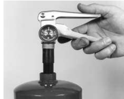
3. Remove the valve and syphon tube from the cylinder by rotating counter clockwise. Mark valve and cylinder if servicing more than one unit. Remove the chemical residue by inverting the cylinder. Failure to do so could result in the packing of powder.