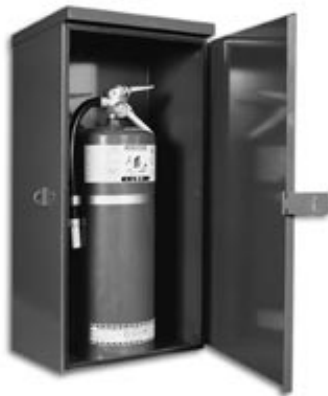
Model CE-1000 Outdoor Cabinet

Model CE-950-5 & CE-950-6: Provide and install N.F.E. Model CE-950-5 (12" X 30" X 8") OR CE-950-6 (12" X 35" X 8") recessed fire extinguisher cabinet constructed of 18 ga. (1.19mm) steel tub and 14 ga. (2mm) steel door & trim with \frac{1}{2} " (13mm) return frame, a full length semi-concealed piano hinge and flush stainless steel door latch. Front section to have full 2" (51mm) adjustment to wall. Entire cabinet finished in powder coated paint and glazed with \frac{3}{16} " (5mm) clear glass.