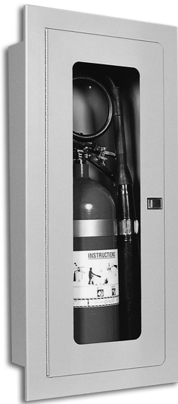
Model CE-950-5 (Semi Recessed Cabinet)

For more cabinet options see pages CAB-02 to CAB-04.